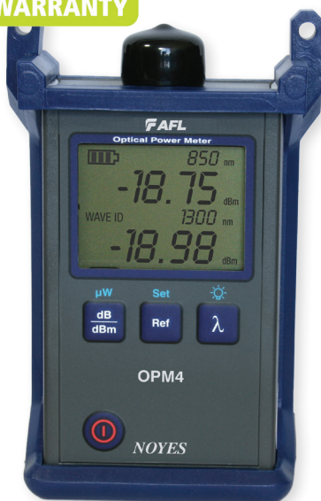
OPM4 Optical Power Meter