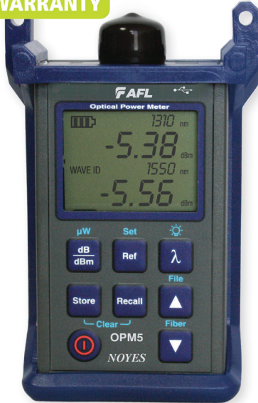
OPM5 Optical Power Meter